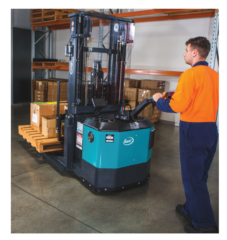
Centrally mounted tiller for excellent visibility of the load