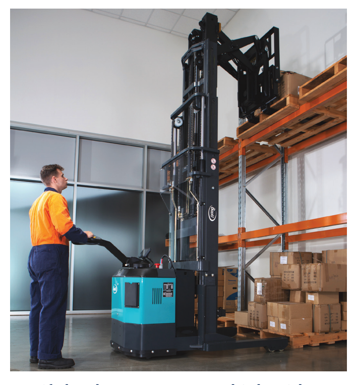
Lift loads over 5 meters high with a reach of almost 600mm