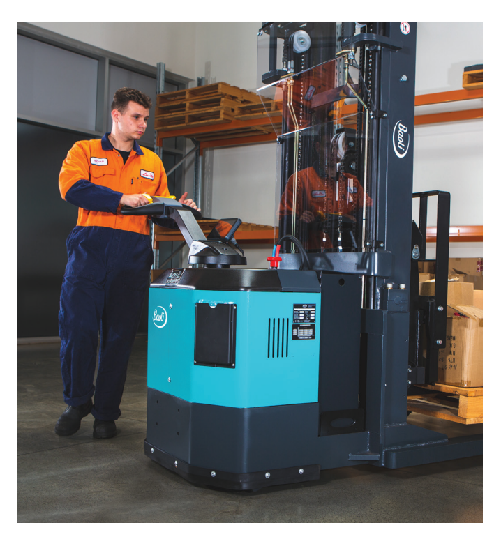
Power steering reduces effort when manoeuvring heavy loads